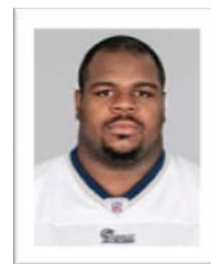
NT Vince Wilfork Pro Bowl Starter 2 nd Career Selection