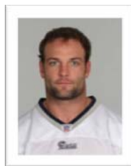
WR Wes Welker Pro Bowl Reserve 2 nd Career Selection