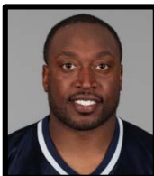
HIGHEST AVERAGE YARDS PER RECEPTION AMONG ACTIVE TIGHT ENDS

Among active NFL tight ends, Patriots tight end Alge Crumpler ranks second in average yards per reception.