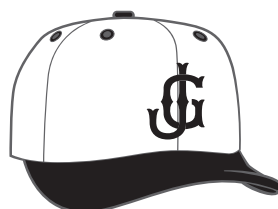
ALTERNATE CAP 1