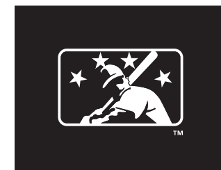
Common colors all caps