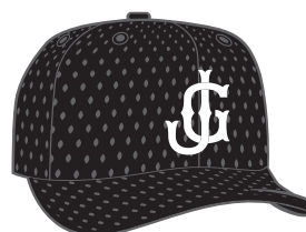
BATTING PRACTICE CAP