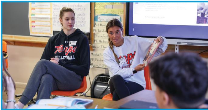
MARYLAND VOLLEYBALL READING TO LOCAL ELEMENTARY SCHOOL CHILDREN IN COLLEGE PARK, MD FOOTPRINT

BIG Impact Reading Week empowers student-athletes by providing an opportunity to serve as change agents in their local community.