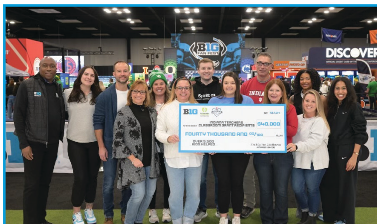
TEACHERS WITHIN THE INDIANA PUBLIC SCHOOLS SYSTEM BEING RECOGNIZED AT 2024 FOOTBALL CHAMPIONSHIP GAME IN INDIANAPOLIS, IN