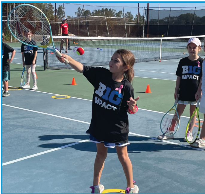
TENNIS CLINIC IN PARTNERSHIP W/ USTA IN SELMA, AL