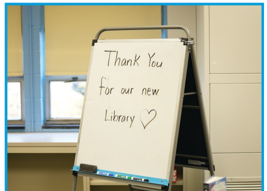
ROBERT FROST ELEMENTARY SCHOOL 106 LIBRARY UNVEILING CEREMONY AT THE 2024 DISCOVER BIG TEN FOOTBALL CHAMPIONSHIP GAME IN INDIANAPOLIS, IN