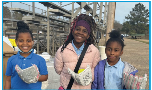
SOFTBALL CLINIC IN PARTNERSHIP W/ RAWLINGS IN SELMA, AL

Hosting sports clinics with partners allows us to create an opportunity to bring athletics to the community. These clinics provided young athletes with hands-on instruction in fostering skills development and a passion for sports.