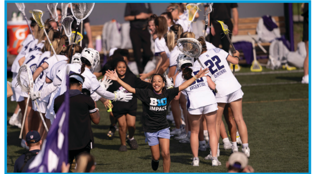
CAMP KUUMBA AT 2024 WOMEN'S LACROSSE CHAMPIONSHIP GAME AT NORTHWESTERN

These activations are dedicated to youth development during championships by offering opportunities to engage with student-athletes and tour athletic facilities. This activation inspires local youth to pursue their goals and experience the passion of collegiate sports, while fostering a sense of community and possibility for the next generation.