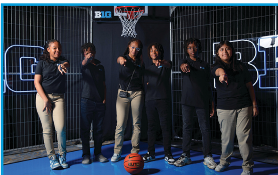
BRUNSON ACADEMY STUDENTS AT BIG TEN BASKETBALL MEDIA DAYS IN CHICAGO, IL

In collaboration with the Chicago Public Schools Foundation, BIG Impact has partnered with Brunson Academy to offer students a unique career experience. Through the Junior Journalist program at Big Ten Media Days, Brunson youth explored careers in communications and gain valuable hands-on experience in a professional sports setting.