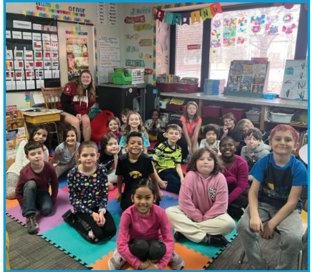
INDIANA ATHLETICS READING TO LOCAL ELEMENTARY SCHOOL CHILDREN IN BLOOMINGTON, IN