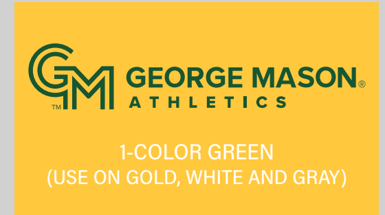
1-COLOR GREEN (USE ON GOLD, WHITE AND GRAY)