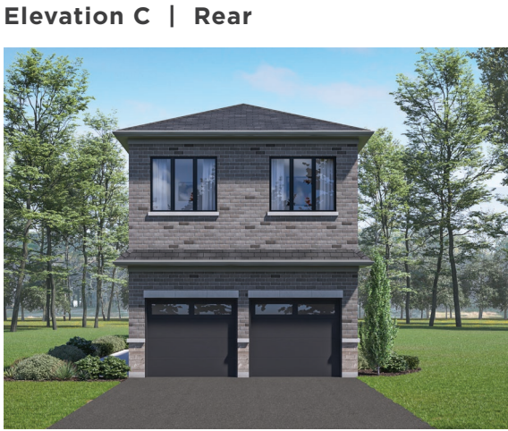
Elevation C | Rear