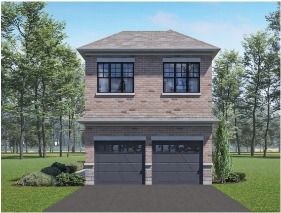
Elevation B | Rear