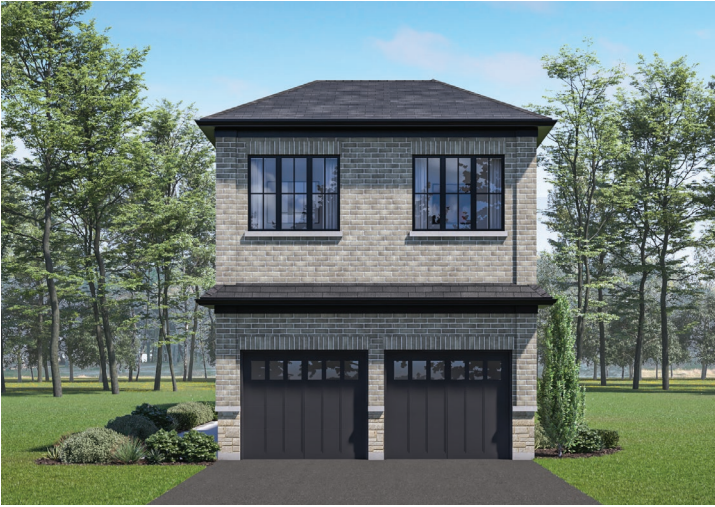
Elevation A | Rear