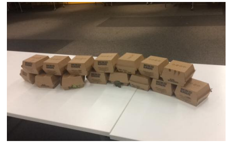
The Great Wall of China