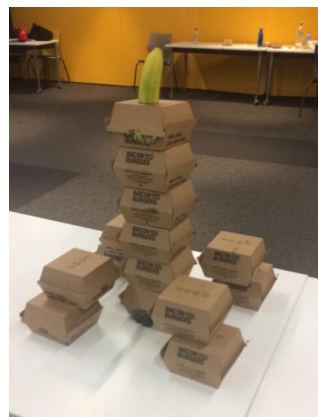
The Eiffel Tower, Paris