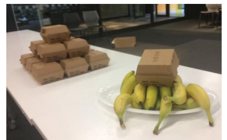
"A banana boat sails down the Nile to deliver marble slabs to the great pyramid at Giza."