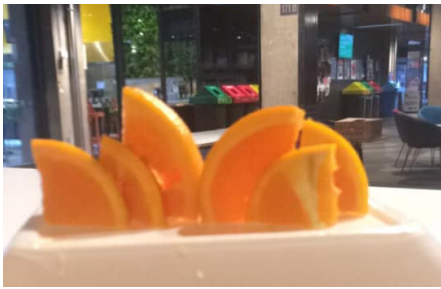
The Sydney Opera House