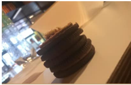
The Beehive, Wellington