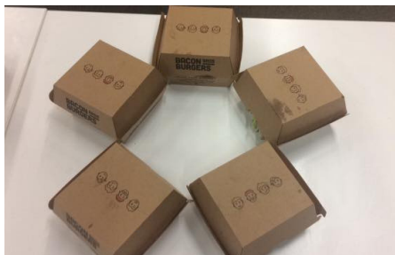
The Pentagon, Washington DC